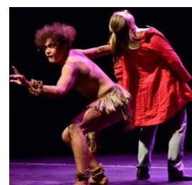
Whangarei Boys' High School ~ The Tempest