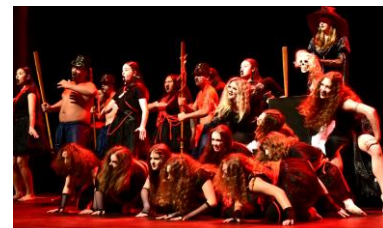
Mount Maunganui College ~ Macbeth

There are very few rules in our Festivals around the presentation of the 5-minute student-directed and 15-minute student- or adult-directed scenes from any of Shakespeare's plays. Do read them and note what the Assessors will be looking for. Mostly we want to encourage the enjoyment in delving into and presenting Shakespeare in any context.