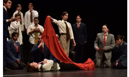
Avondale College: Julius Caesar

Please would you pass on the Allied Competition Entry Forms to the Fabrics/Music/Art/English or whichever other relevant teachers or personnel are applicable. These Competitions can be done in the classroom or as individuals. There are great prizes and add-on 'rewards' for winners of these too!