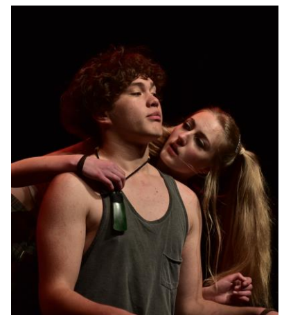
Waipapa Youth Theatre: The Taming of the Shrew

While Reg Reps work from the Action Plan provided by SGCNZ, there is some flexibility to accommodate local needs, such as adjusting dates (as long as your Regional Festival is held by 11 April), venues, the number of Assessors (1–3), workshops, and other arrangements.